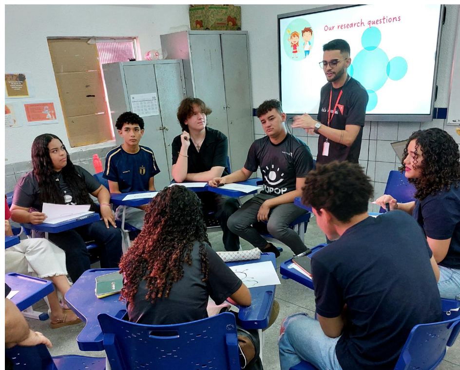
In-person workshop for child-led research on school meals in Brazil